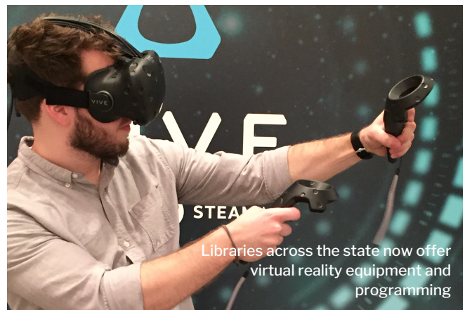
Libraries across the state now offer virtual reality equipment and programming

2,400,000 Marylanders attended 90,000 programs