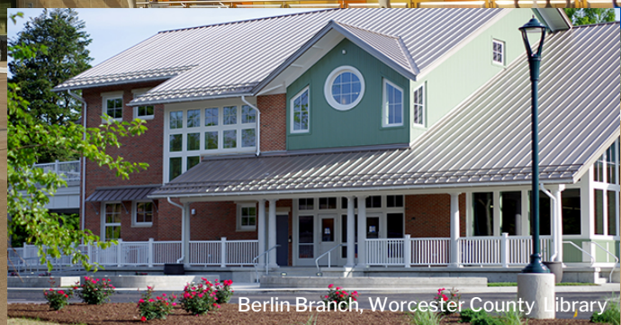
Berlin Branch, Worcester County Library

$300,000,000 in local matching funds generated since 2008