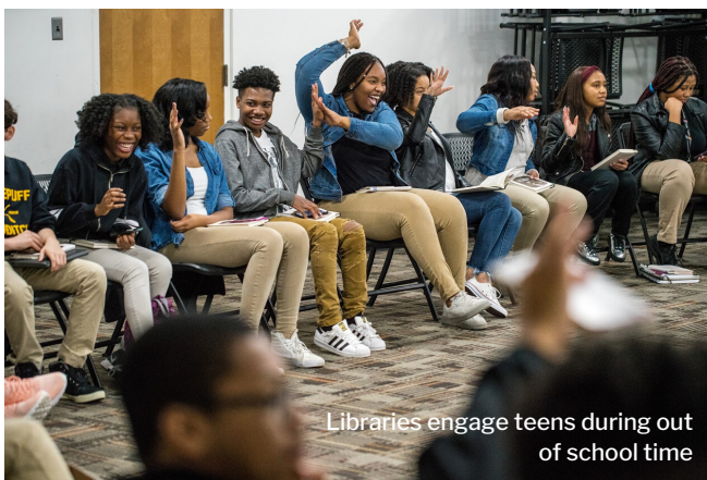
Libraries engage teens during out of school time