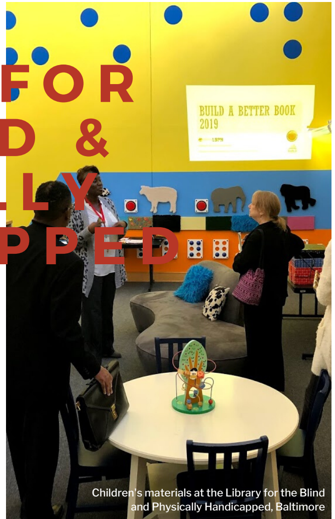
Children's materials at the Library for the Blind and Physically Handicapped, Baltimore

The mission of LBPH is to provide comprehensive library services to blind and print-disabled Maryland residents. LBPH provides a full range of reading and tactile materials, as well as book clubs and innovative cultural and educational programs. LBPH also manages the Maryland Accessible Textbook (MAT) program, which provides print-disabled students in higher education programs with their required course textbooks in a converted format.