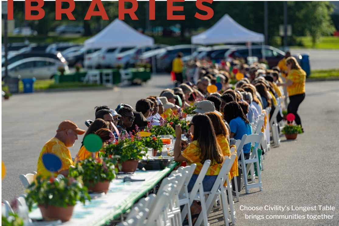
Choose Civility's Longest Table brings communities together

3,600,000 customers (that's 60% of Maryland residents)